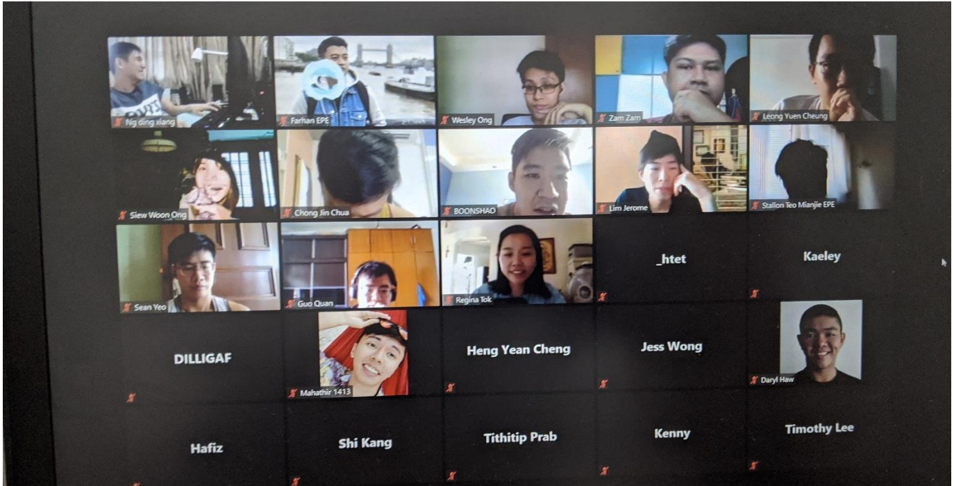
Fig. 4 Students who participated in the technical quiz

Dhivya Sampath Kumar PES DAY Ambassadors IEEE PES Singapore Chapter