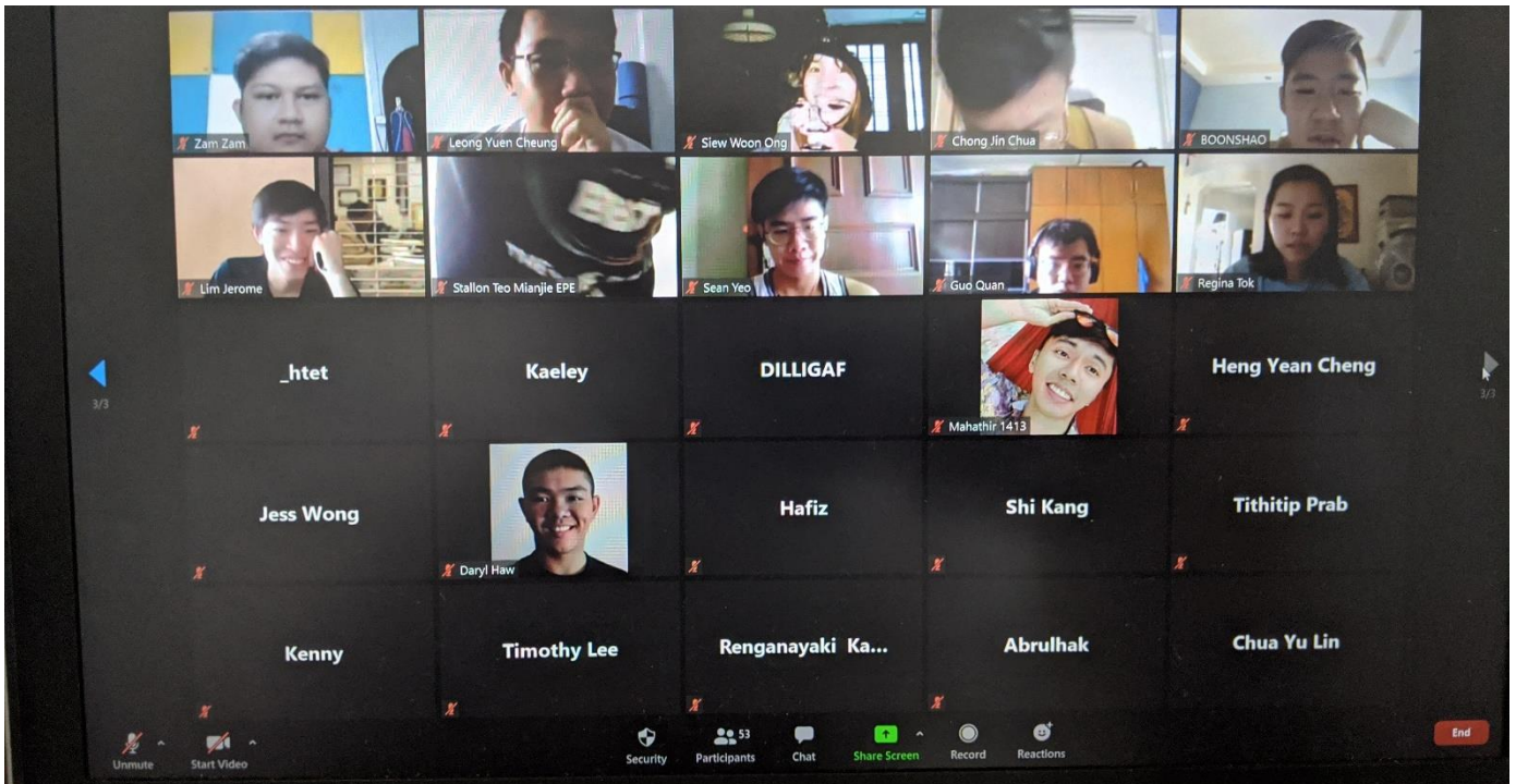
Fig. 3 Students who participated in the technical quiz