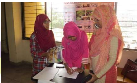
BUET WIE SB AG Executive Committee members at work

BUET WIE Student Branch Affinity Group organized a Membership Drive from April 10, 2017 to April 12, 2017 to recruit and retain members. The drive was first of its kind for BUET WIE SB AG and was outright successful in its mission.