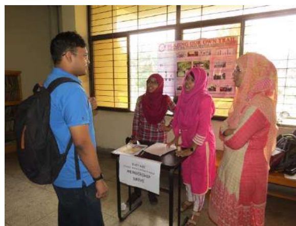
An enthusiastic student learning about the importance of IEEE membership