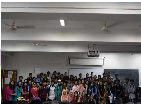
The participants with our instructors

A workshop named "PCB Designing Workshop for Beginners" has been jointly organized by BUET WIE Student Branch Affinity Group and WIE Affinity Group, IEEE Bangladesh Section on 5 th April, 2017 at the Department of EEE, Bangladesh University of Engineering and Technology (BUET).