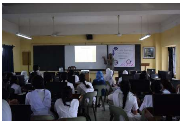
Students of Holy Cross College attending the workshop

awarded. We thank our appreciative and enthusiastic participants without whom the program holds no meaning. Their eagerness and patience motivated the instructors to help them out with all the projects they wanted to implement.