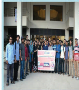
Industrial Tour at NLDC

To celebrate IEEE DAY 2017, BUET WIE SB AG and WIE AG IEEE BDS had jointly organized an industrial tour Participant: WIE Member : 25 Non-IEEE Member: 15 Place: National Load Dispatch Center, Rampura, Dhaka. Date: October 19, 2017