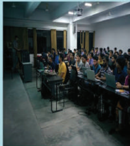
Workshop on Simulink

To celebrate IEEE DAY 2017, BUET WIE SB AG and WIE AG IEEE BDS had jointly organized an industrial tour Participant: WIE Member : 25 Non-IEEE Member: 15 Place: National Load Dispatch Center, Rampura, Dhaka. Date: October 19, 2017