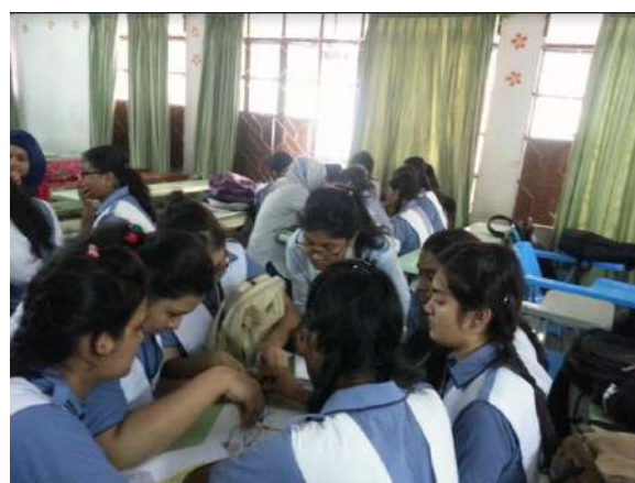
Enthusiastic participants and dedicated volunteers

profession. The participants were then provided with logic gates, wire, LED to implement the circuits they had learnt in their textbook. The spark that was seen in their eyes when the LED was blinking is worth mentioning. Then they were also provided with some theoretical knowledge about number representation and arithmetic circuits. At last, they got really excited when they saw the practical application of the theory they have learned with their own eyes.