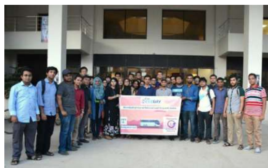
Group photo of participants in the industrial tour

An industrial tour at National Load Dispatch Centre (NLDC) was jointly arranged by WIE BUET Student Branch Affinity Group and WIE Bangladesh Centre as a part of the IEEE DAY celebrations 2017. The tour was held in 19 th of October, Thursday.