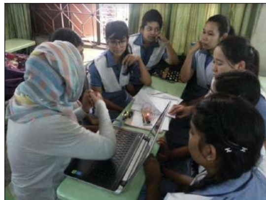
Super interactive mentoring

that would grow their interest to take engineering as