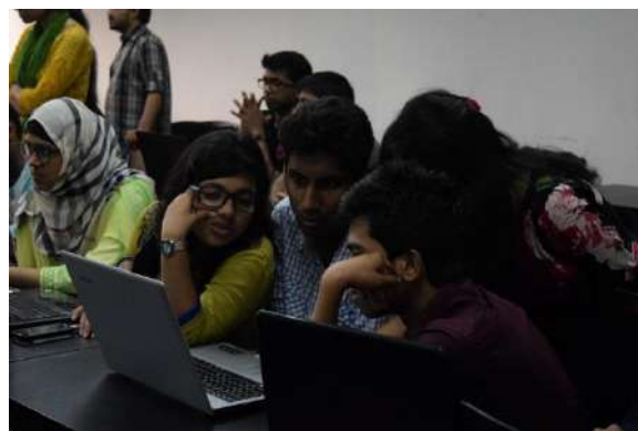
The enthusiastic participants