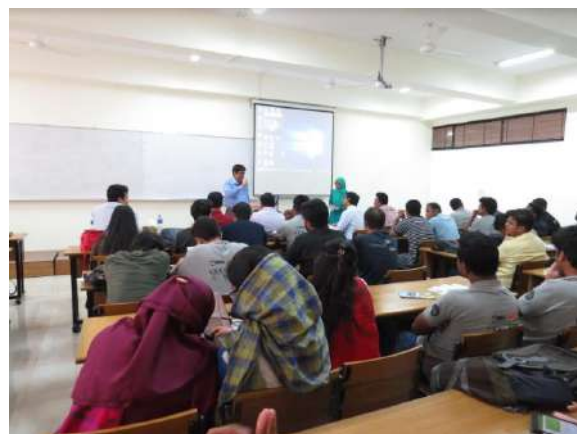
Interactive session among speakers and participants