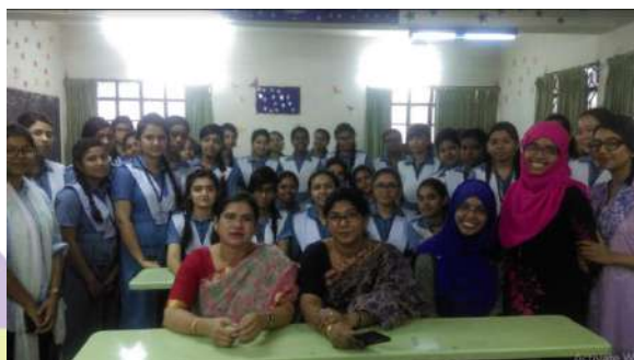
Group photo of participant with instructors and volunteers

BUET WIE Student Branch Affinity Group is pleased to announce the successful completion of the first ever outreach program organized for pre-university students held at YWCA Higher Secondary Girls' School on April 4, 2017.