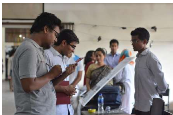
Judging segment with our honorable faculties

Over the years, poster presentation has become one of the main attractions of conferences. To present research work in a conference and grab attention to a research topic, knowledge about