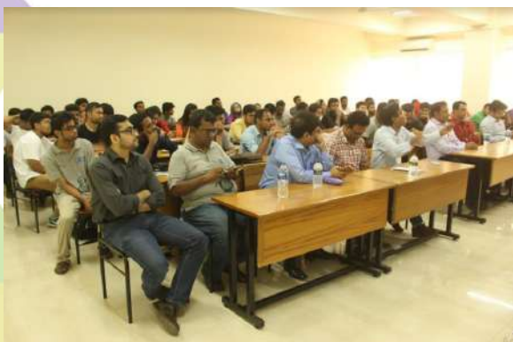
Participants attending the talk

Worrying throughout the university life about none other than career has become the undeniable fate of the students. Therefore, Department of EEE, BUET, in collaboration with BUET WIE Student Branch Affinity Group, organized a “Job Seminar” on the occasion of EEE Day 2017, to give a break to this dread that has consumed minds of the graduating students. The event, sponsored by Islami Bank Bangladesh Ltd. was held on the 18 th of May, Thursday, 2017, from 10:30am to 2:00 pm. The Job Seminar was one of the most crucial parts of the celebration, including a successful talk about job opportunities, featured by important representatives from various industries. A total of 80 ambitious and enthusiastic graduating students were present in the seminar.