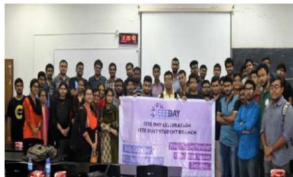
Group photo of participants with instructors and volunteers

Lecturer, Dept. of EEE, BUET and Treasurer, IEEE EMBS Bangladesh Chapter. In the first part he discussed about the software, its uses and also discussed about its interface.