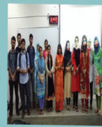
Road Show by TechBeez