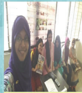
BUET WIE SB AG Membership Drive

BUET WIE SB AG organized a Membership Drive to recruit and retain members. Place: ECE Building BUET Date: From April 10 to April 12, 2017