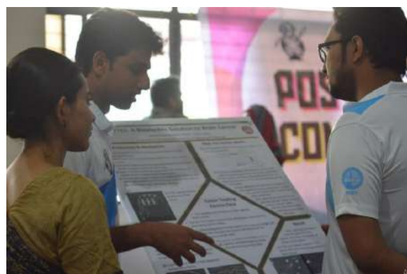
Participants demonstrating their posters

The range of projects showcased on posters varied, but were mostly humanitarian, with a few in the field of technological advancement. The colorful posters graced the plinth of ECE Building, BUET on 18 th afternoon and were visited by other project enthusiastic students. The enquiries of the students were answered diligently by the teams comprising of 2-3 members.