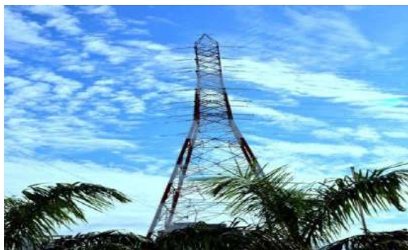
Transmission tower at NLDC

It was astounding to see the huge response we received. We would be honored to thank our appreciative participants without whom this tour would have been next to impossible to organize. The eagerness to learn more and the patience that they showed were motivating.