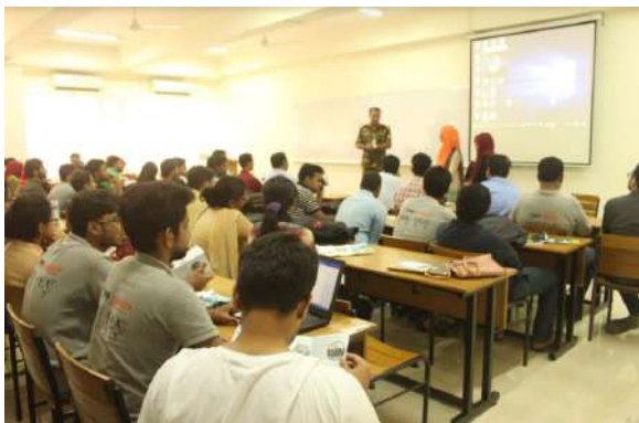
A good number of female participants attended the seminar

Department of EEE, BUET from honorable faculties of the department.