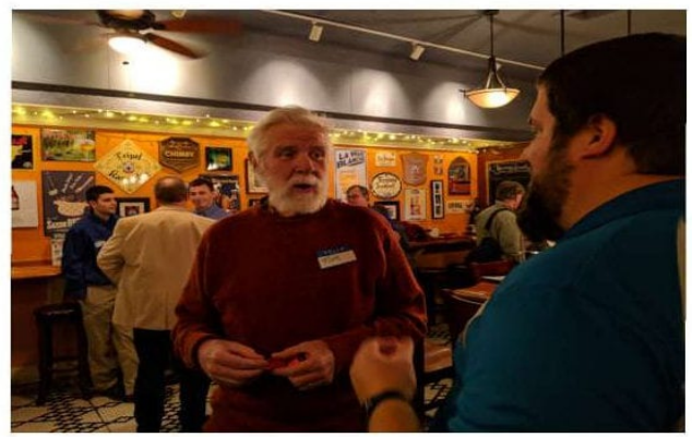
IEEE-Madison December 2017 Election/Social Event