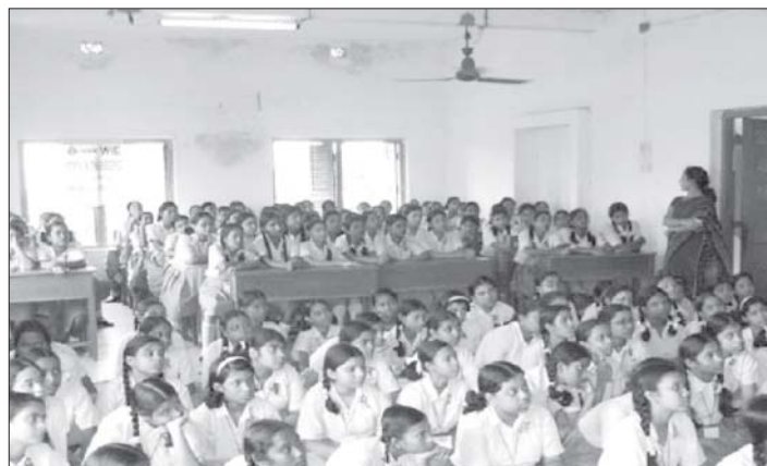
Student participants in awareness program – Lake Girls' School, 11 Aug 2007