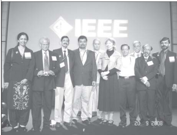
Indian Presence at Quebec, Canada. Report in November issue