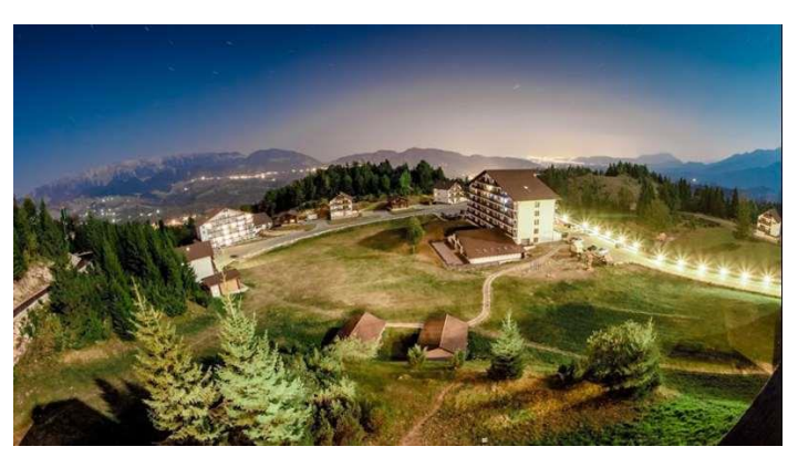
CHEILE GRADISTEI Resort, Fundata <a href="http://www.cheilegradistei.ro">http://www.cheilegradistei.ro</a>

The OPTIM-ACEMP 2021 Conference location is Cheile Gradistei Resort, situated in Fundata, at 12 km from Bran Castle (Dracula's Castle, above image, built around 1370) and at 35 km from Brasov city.