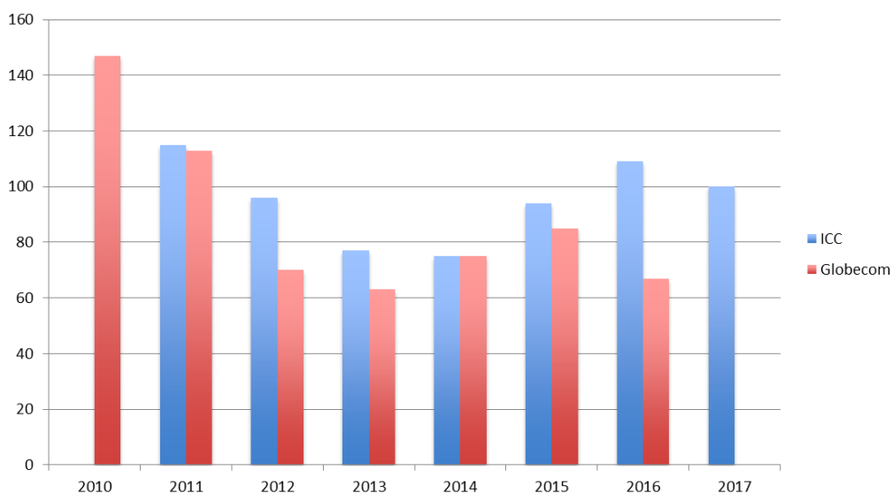
Submissions to ONS