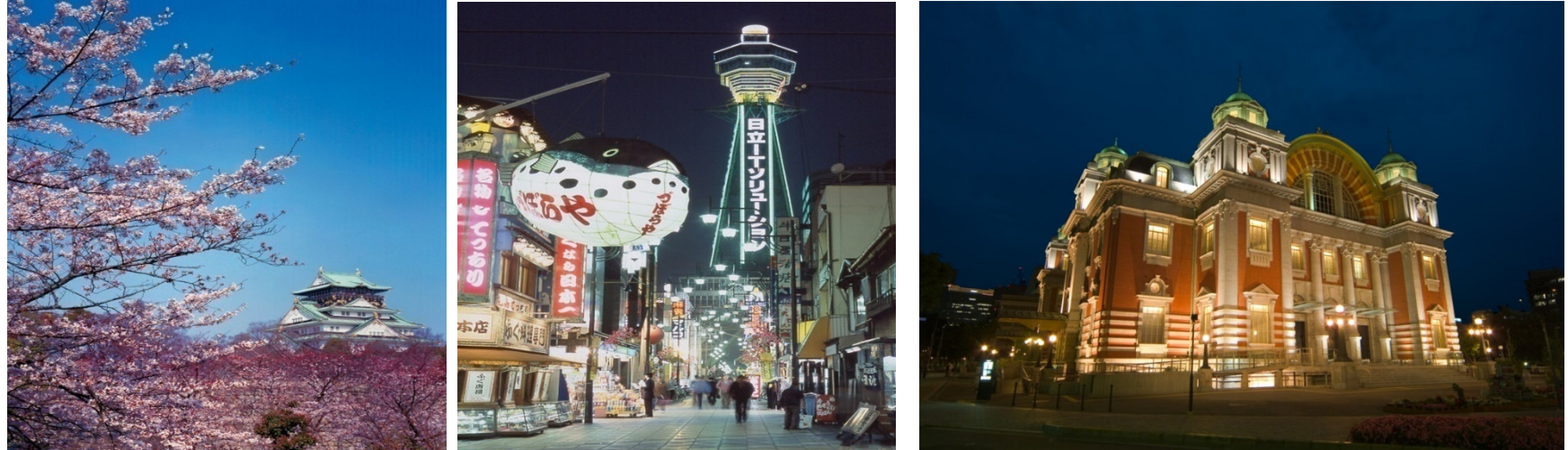
IFIP/CNOM Meeting @ MANWEEK 2009