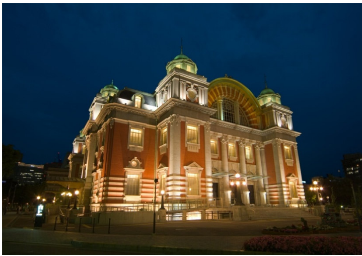
CNOM Meeting @ Globecom 2009