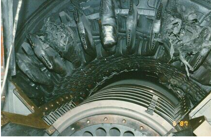
Ring-of-fire failure of a Stator End Winding

My career in turbine-generators spanned the 63 years 1950 to 2013 - a period that saw huge technical evolution of generator design and output capability, a period that ranged from little-to-no government involvement, to deep impact (and interference) of government on almost all aspects of the power industry.