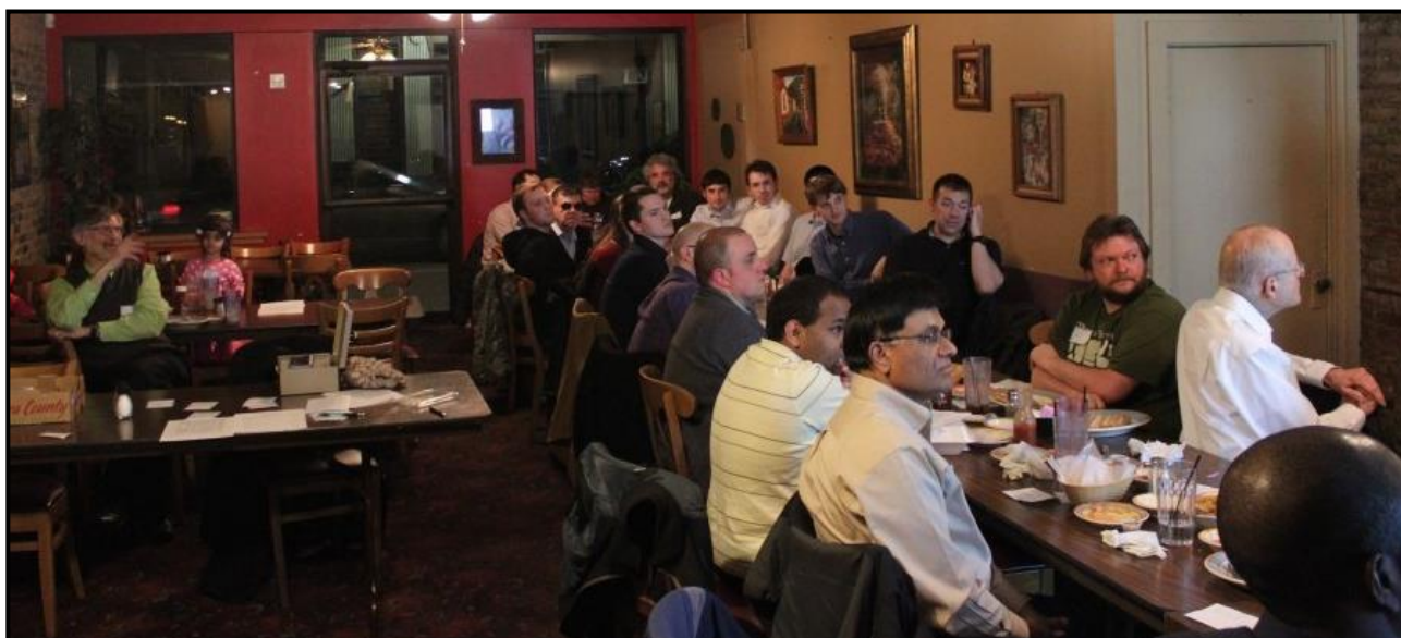
The annual NIU Student Branch networking social at Rosita's in DeKalb.