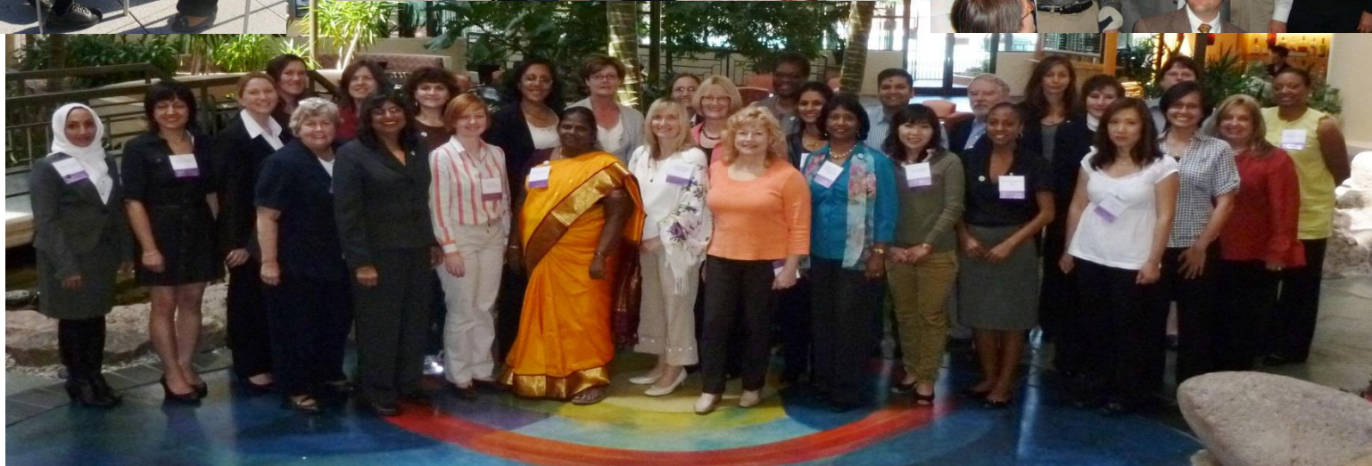
Activities over the past years