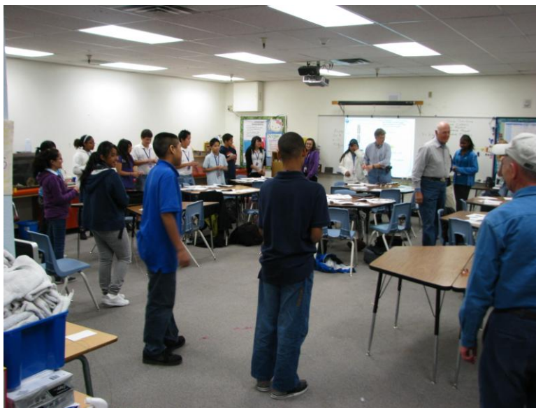
Demonstrating Series Circuits: Each Student Held Together Ends of Two Wires Between Pairs To Complete A Circuit Around The Whole Class to Sound A Buzzer