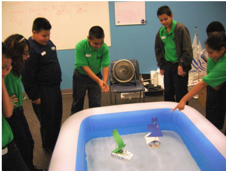
Testing And Racing