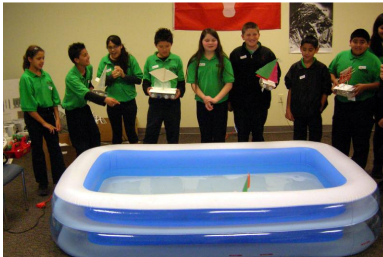
One Happy Group!