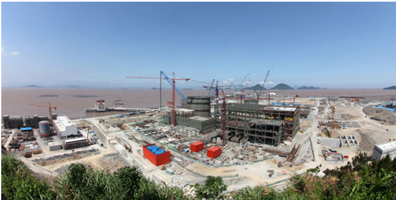
Sanmen site view