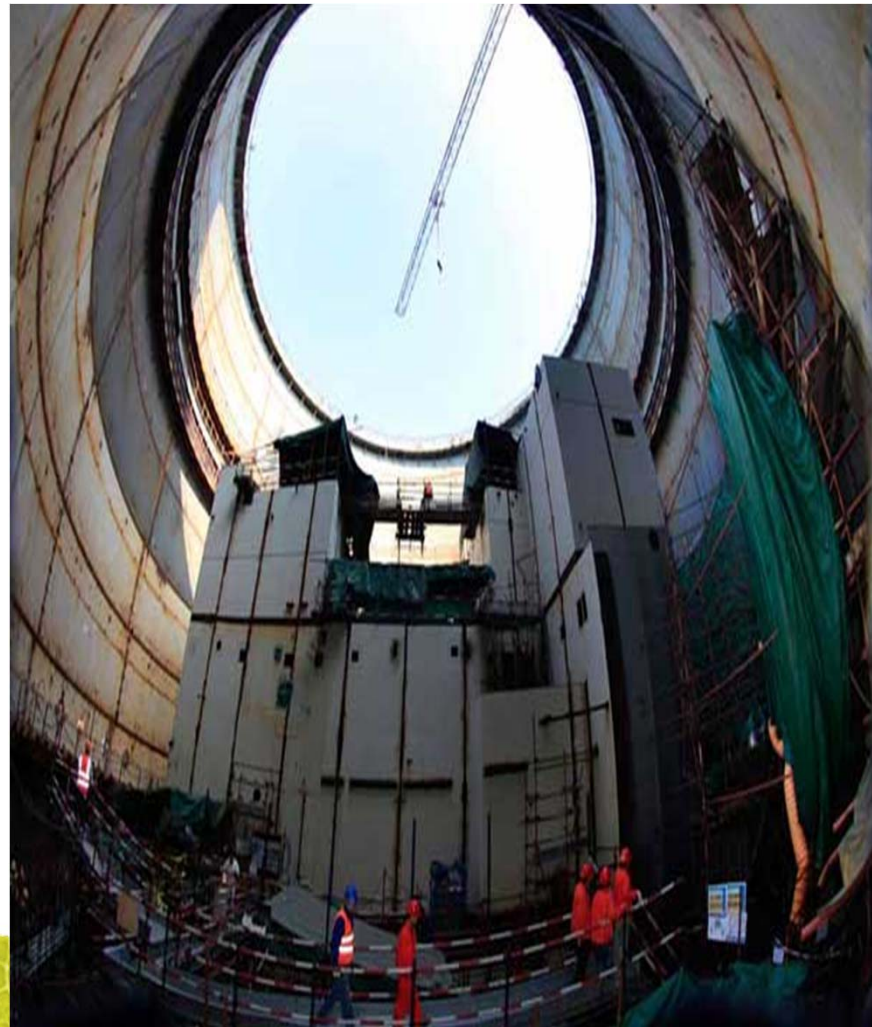
Unit 1 Containment Vessel Ring 4 (CVR4)