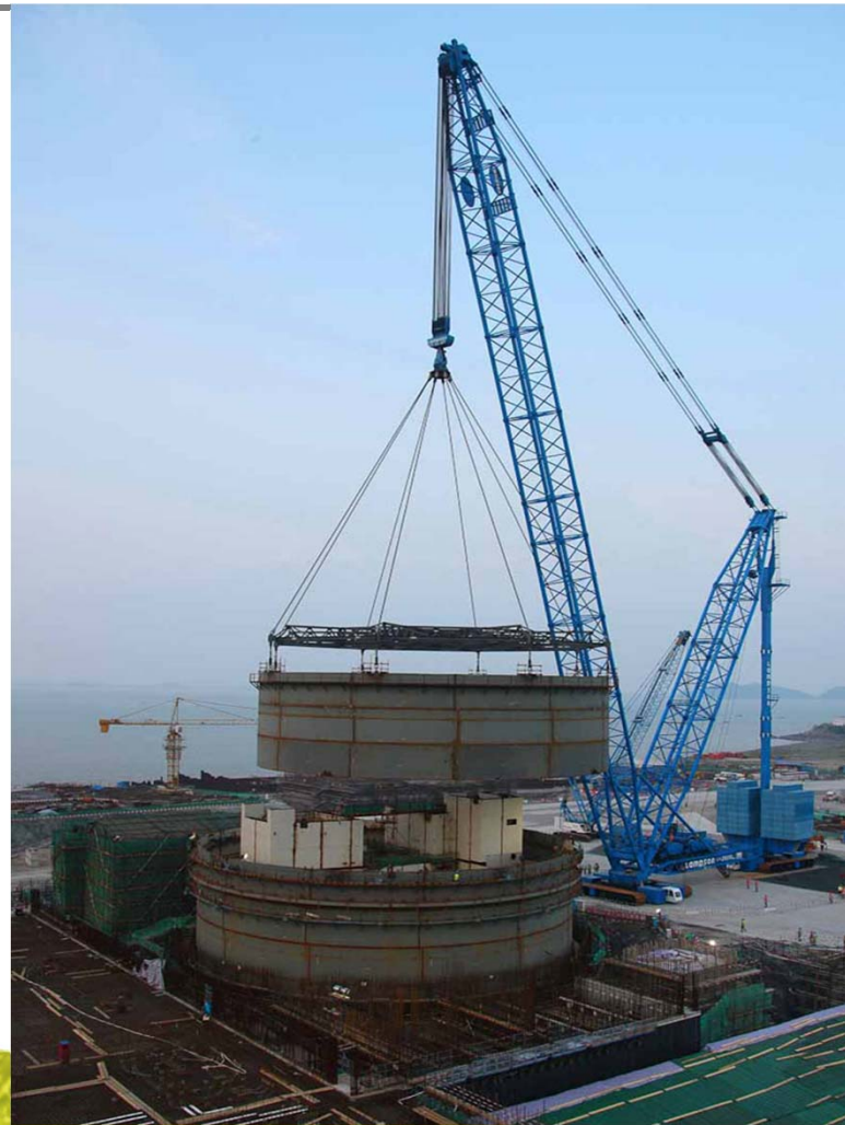
Unit 1 Containment Vessel Rings