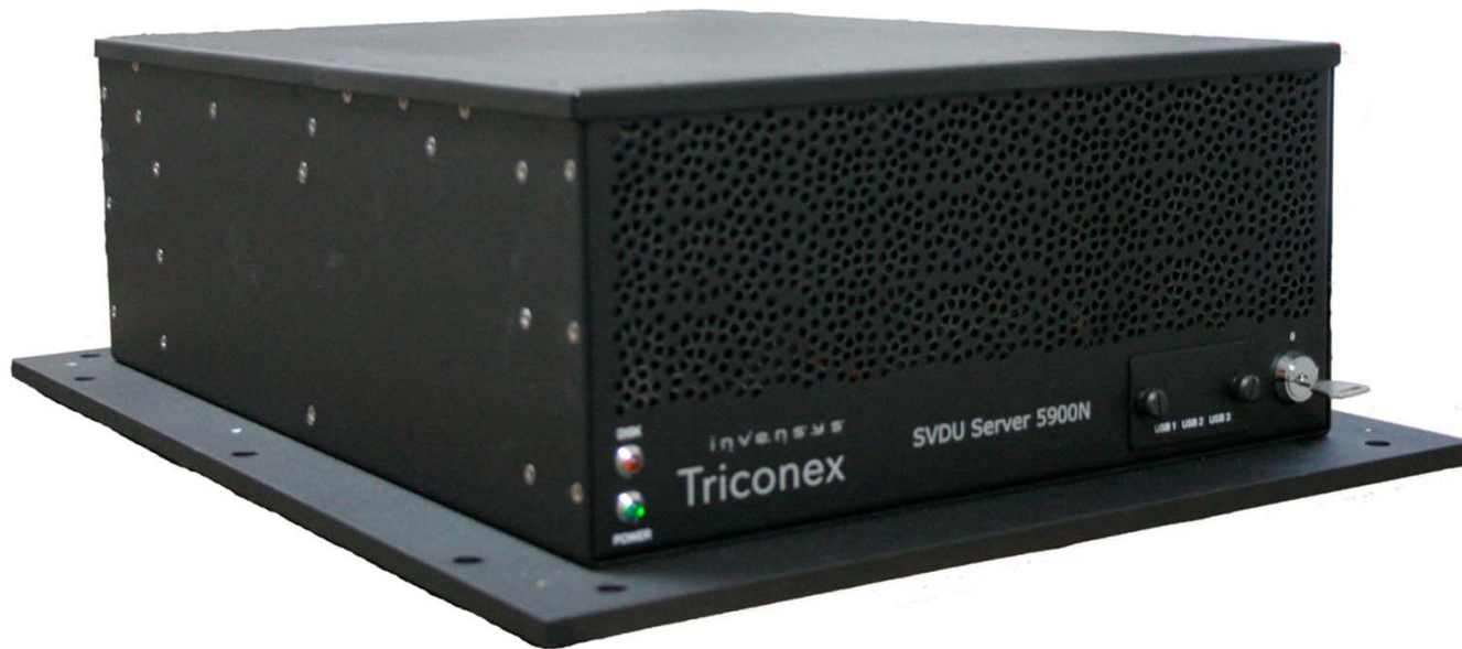
SVDU Server 5900N