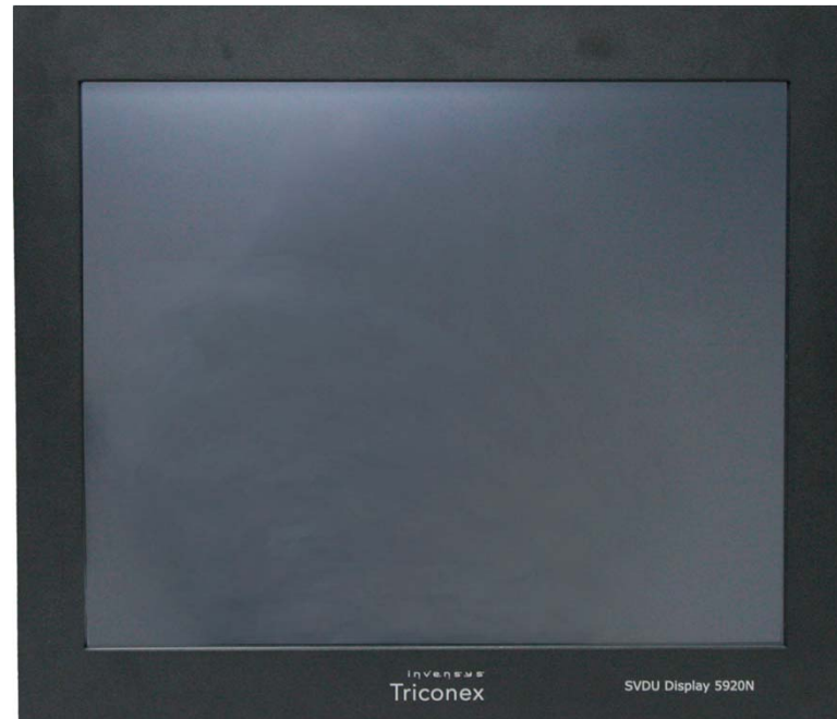
SVDU Monitor 5920N