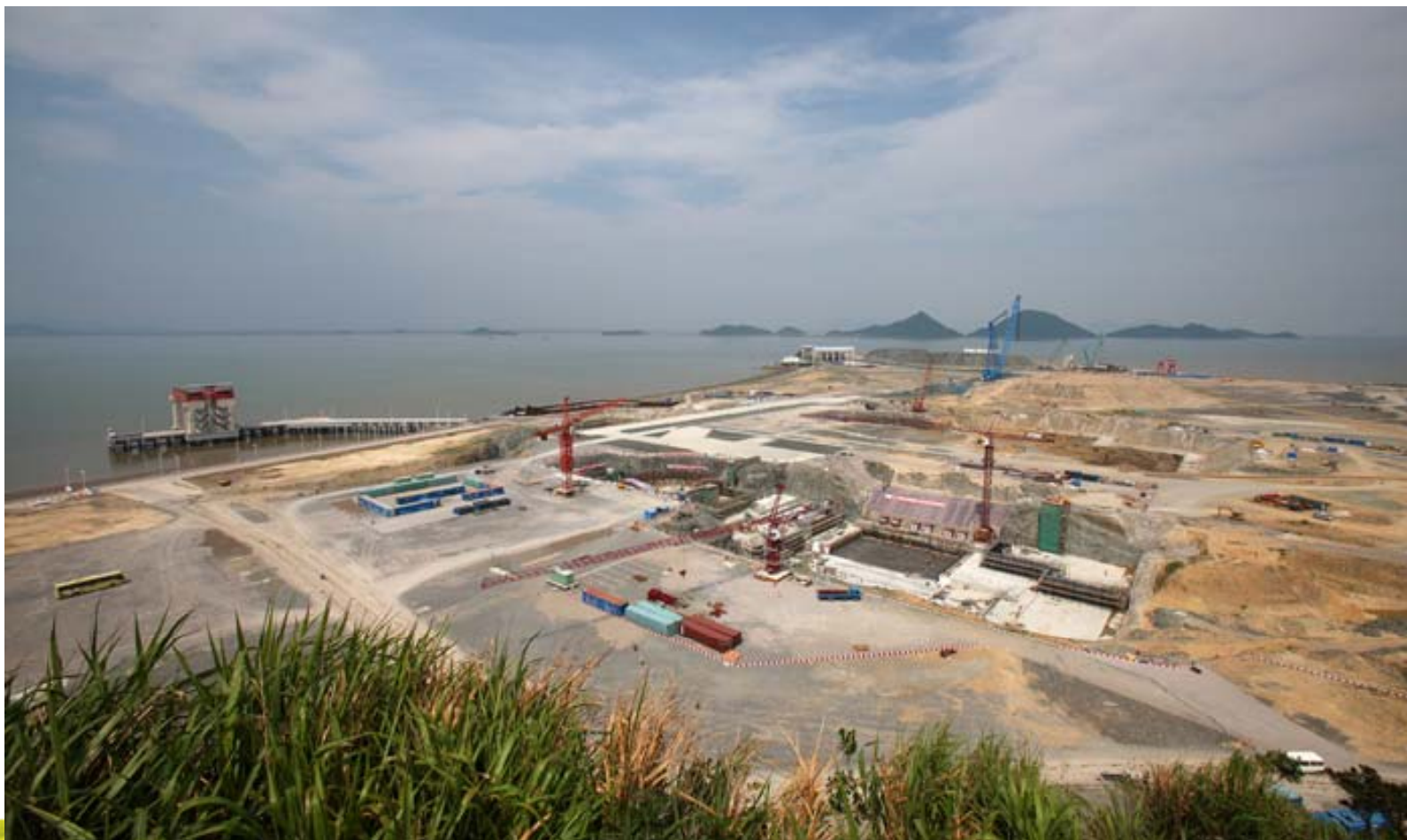
Sanmen site view