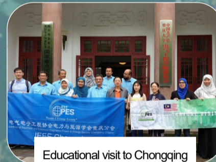
Educational visit to Chongqing University, China