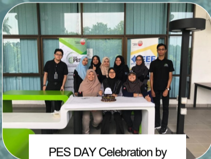
PES DAY Celebration by UNITEN PES SB Chapter