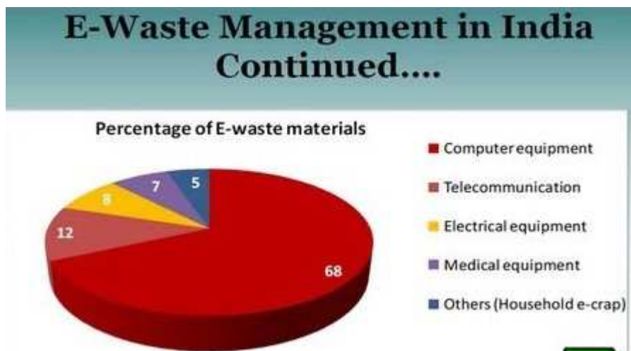
Figure: figure showing only 12% of mobile phone e waste is being generated in India in comparison to other types of E waste.

The maintenance of the e-waste management and the rules related to it has become one of the most prominent difficult challenges faced by the EEE in India. On the other hand, other reason caters to this is that many stakeholders are involved in such business and the act of e-waste management has been conducting in an informal manner since last several years. The concept of unauthorised e-waste management can be defined in terms of stakeholders who are not liable and authorised for handling and controlling certain aspects of E-waste management and consider an unsystematic and illegal way of e-waste Apart from this, unauthorised e-waste is the fact of storing the electronic items that are intended for distempering in an unhygienic manner. It is realised from the report of manufacturer's association for information technology (MAIT) that more than 90% of the e-waste materials are being dismantled in the remote colonies in the cities in an unhealthy and disorganised manner, unaware of the hazardous impact of such aspects on the society and environment as well. Another prominent challenge in this regard is that the current e-waste collection involves the monetary exchange in which the people charge money for providing their unused electronic items Such involvement increases the interest of the non-official e-waste recyclers and incorporates challenges for the government to resolve it.