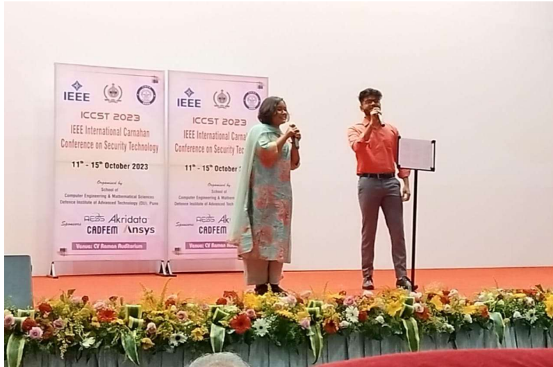
Figure 39: Cultural Program was presented by students of DIAT