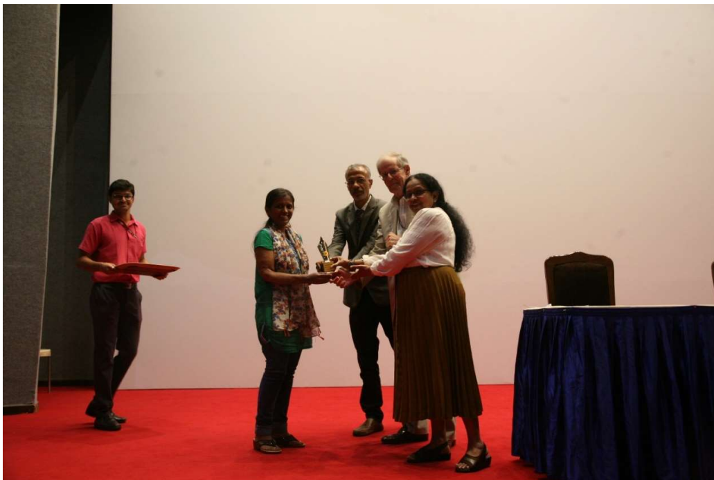
Figure 34: Presentation of Best Paper award