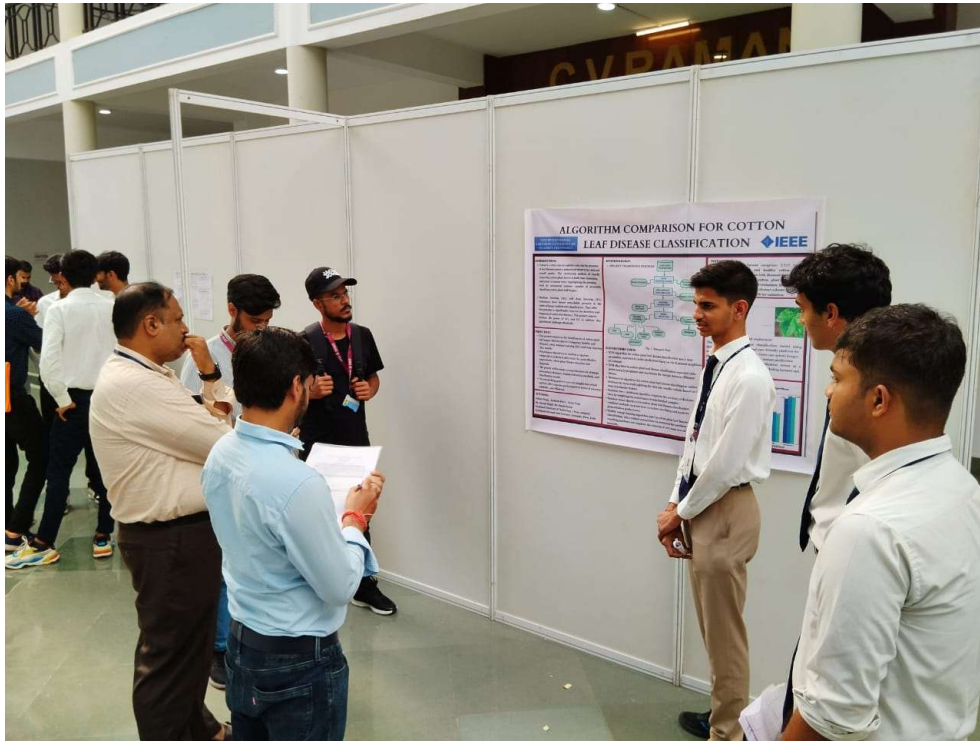
Figure 26: Poster Presentation session in progress