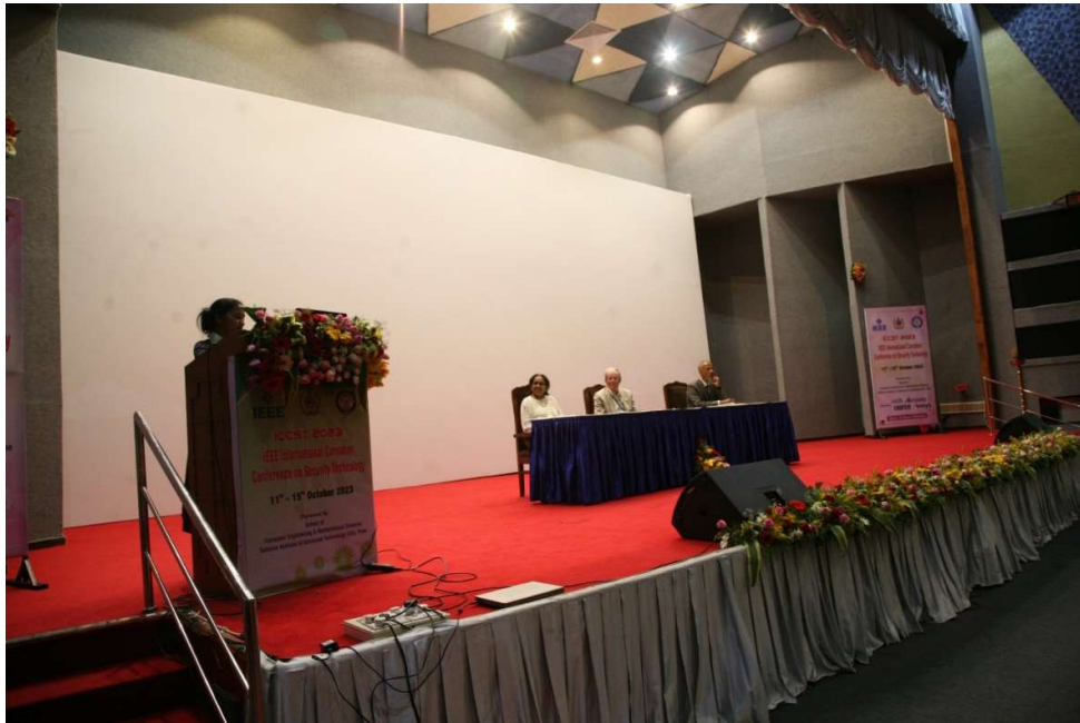
Figure 36: Dr Sushma compering the valedictory function