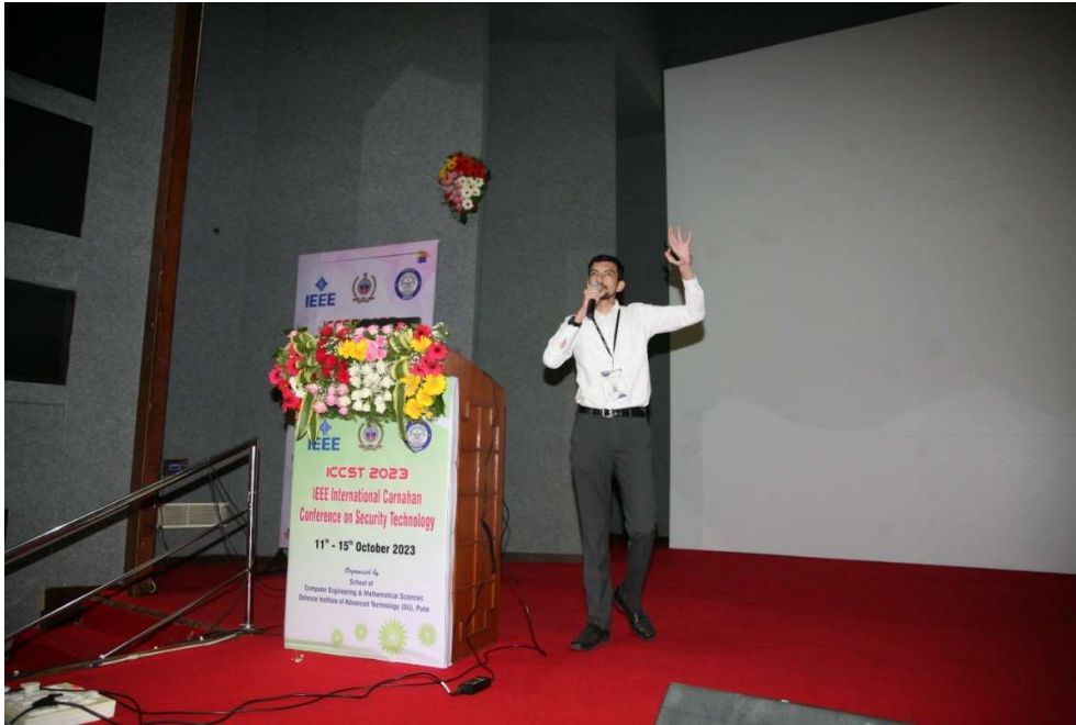
Figure 18: Paper presentation by one of the authors