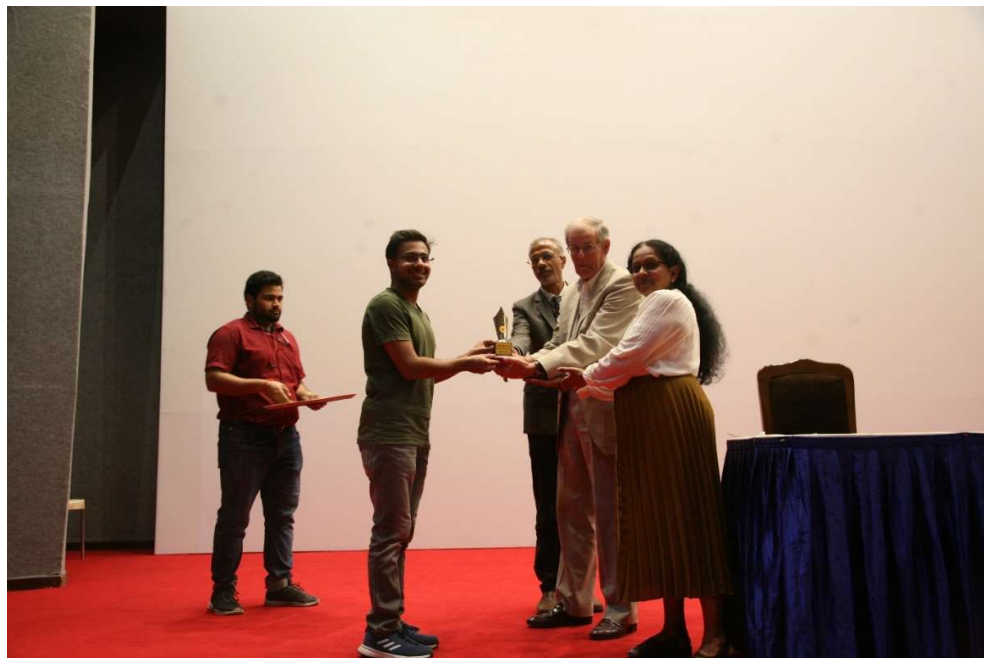
Figure 32: Presentation of Best Paper award