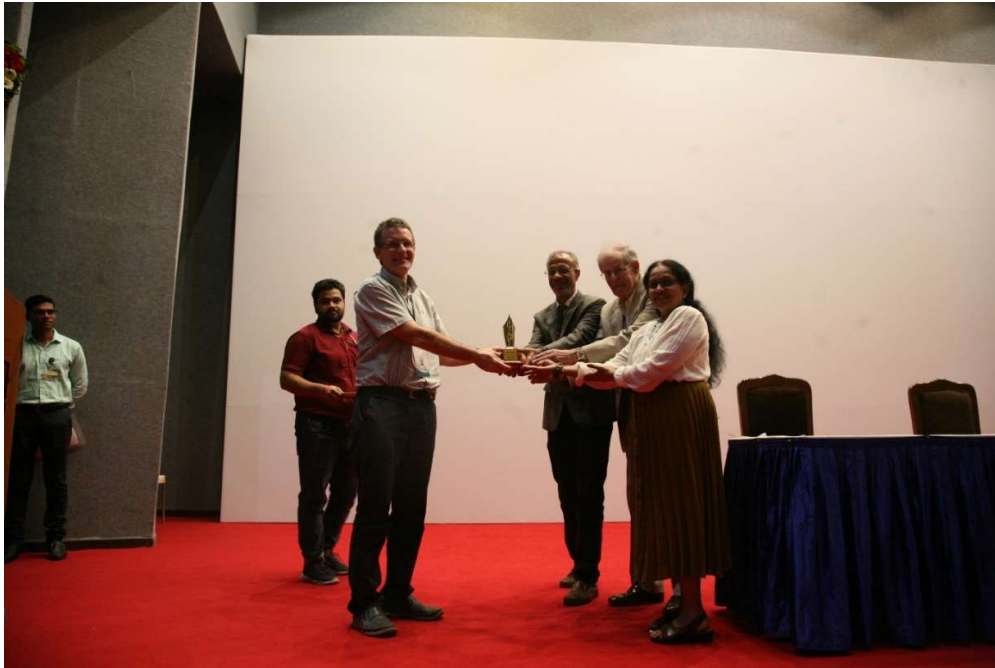
Figure 33: Presentation of Best Paper award to Prof Miguel Angel Ferrer for his paper entitled "3D Synthetic On-Air Signatures for Biometric Attack"