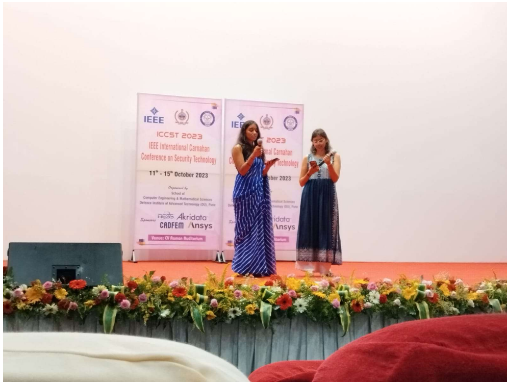
Figure 41: Students performing during cultural program