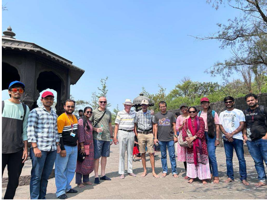
Figure 43: Sight Seeing Trip for the participants of ICCST 2023 on 15th Oct 2023