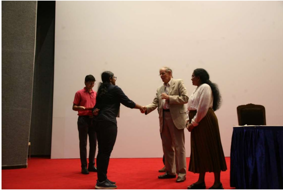
Figure 35: Presentation of Best paper award