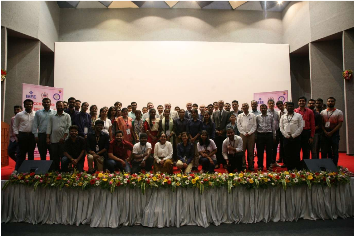
Figure 37: Group photo of participants after the Valedictory function