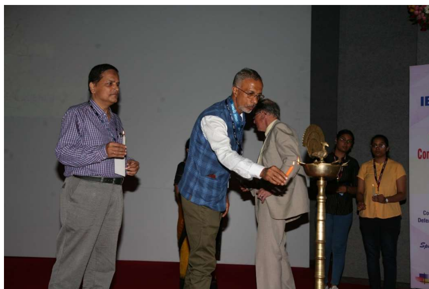
Figure 5: Lighting the lamp