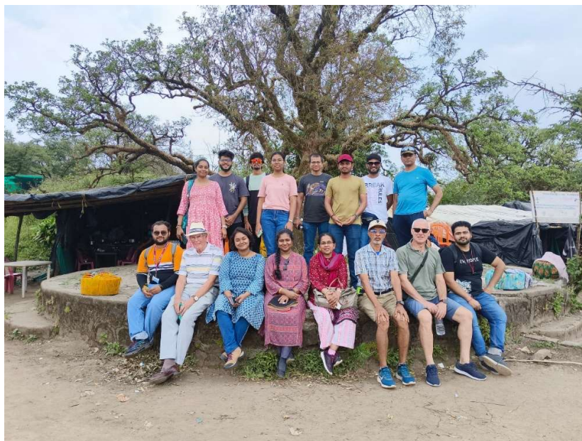
Figure 42: Sight Seeing trip to Sinhagad Fort organized for participants