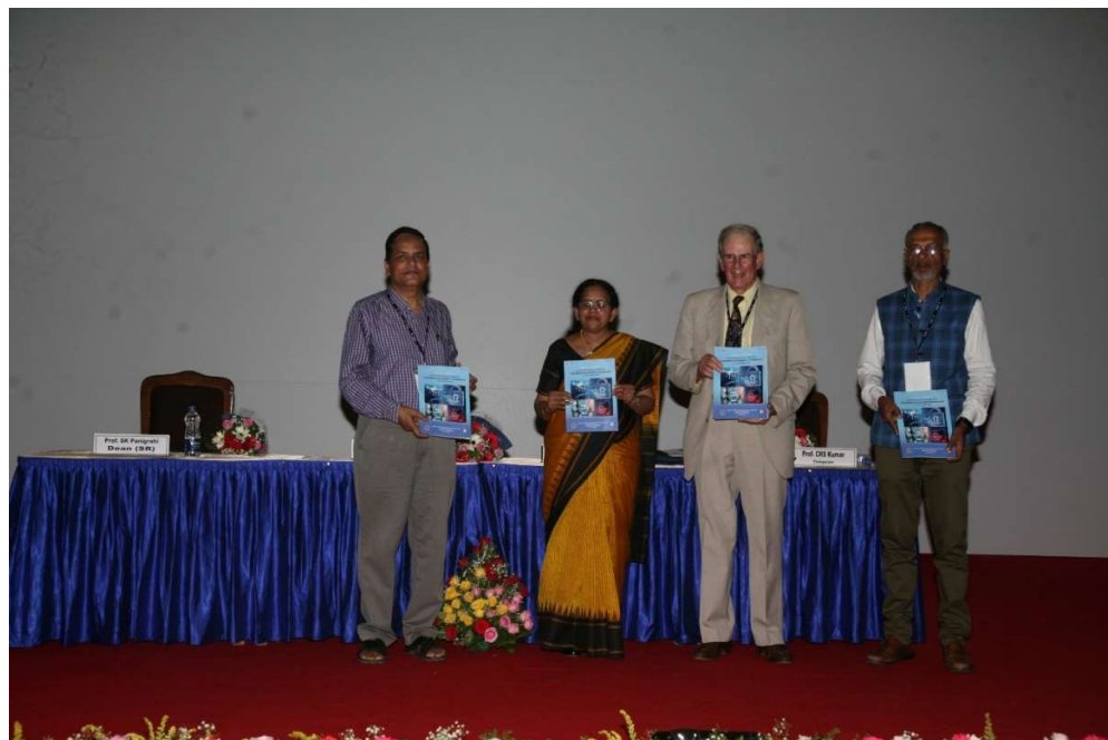
Figure 9: Release of the Proceedings of the conference Program