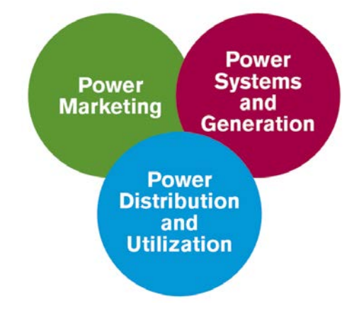
Fig. 2 A pictorial of power engineering coverage for the Future Grid

Already the proliferation of distributed generation in some areas, particularly rooftop solar, has caused many changes in the grid: load shapes are changing, power is flowing back onto the grid, and there are increasing communication needs in the system. The Future Grid is anticipated to have many more sources of energy and power, in addition to more renewables and cleaner sources of central station generation, including nuclear, natural gas and clean fossil fuel plants. The largest sector renewable resource is presently hydro, but wind energy is the fastest growing sector and wind is likely to overtake hydro as a percent resource in ten years. If one coalesces power marketing, transmission distribution, generation resources, and energy utilization, one obtains the overlapping domains depicted in Fig. 2.