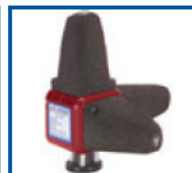
Probes & Monitors