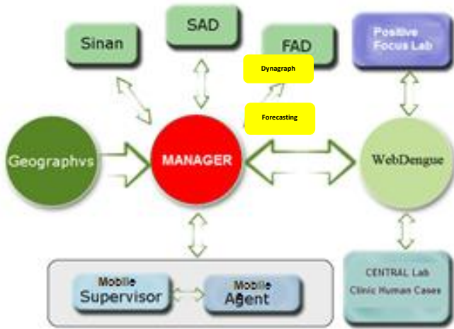
FIGURE 1: COMPUTATIONAL FRAMEWORK FOR DENGUE DISEASE CONTROL AND COMBAT.

WebDengue system is basically used to improve the information gathering (cases and focuses) coming from the health units and sanitary agents on the field.