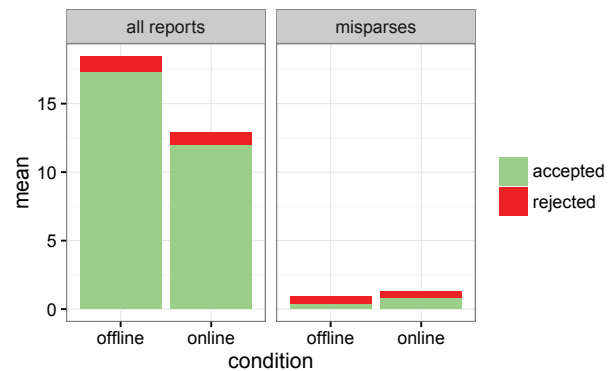
Fig. 2 Mean number of accepted and rejected reports per participant. Left: all reports; Right: misparsed reports.

As mentioned previously, the participants in the offline groups submitted more reports overall, and the accept/reject rate is similar across conditions (1251/1330 = .94 accepted offline, 1071/1152 = .93 accepted online), as shown in Figure 3. Among the misparses, however, the offline participants had a higher rejection rate, with the online participants more likely to accept misparses (28/65 = .43 accepted offline, 77/119 = .65 accepted online).