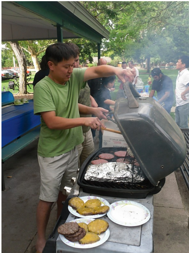
Student members grilled burgers and hot dogs