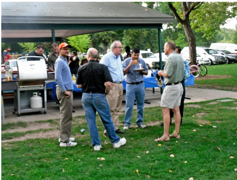
Members got chance to enhance their networking