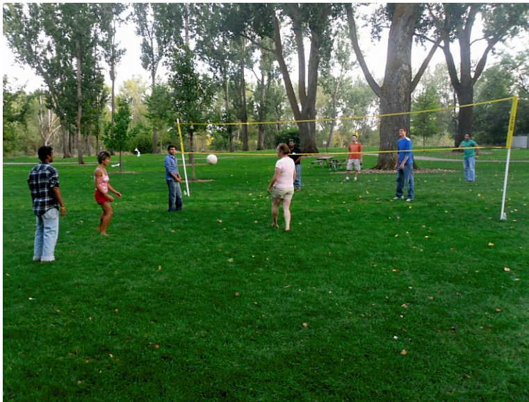
Great weather also gave chance for some games