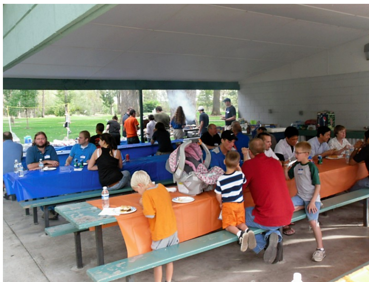
Family members enjoyed the evening with delicious food