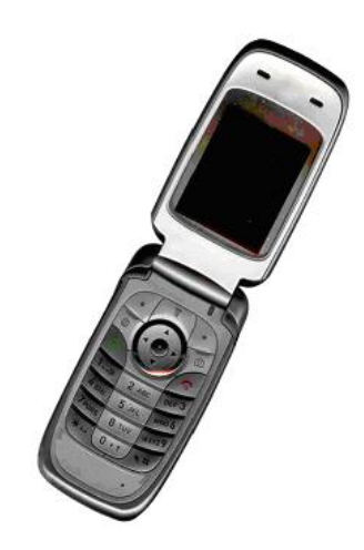
Fig. 3. Example of an image with acceptable resolution.