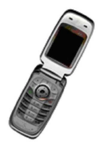
Fig. 2. Example of an unacceptable low-resolution image.